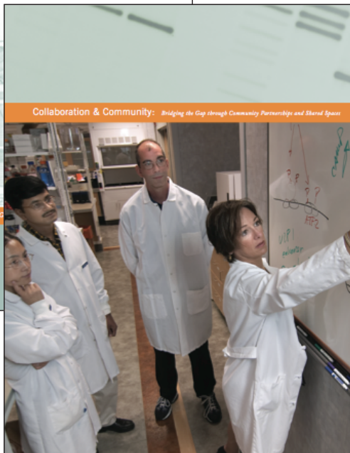
Collaboration & Community: Bridging the Gap through Community Partnerships and Shared Spaces